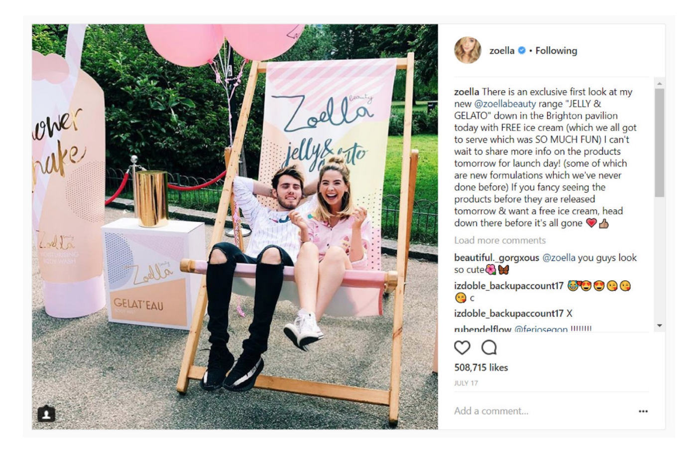
Figure 3: Benevolence (Zoella, 2017p)

In addition, she promotes videos targeted solely to help her fanbase navigate difficult periods within their lives and actively discusses taboo topics, such as periods, to help increase her audience's confidence within themselves. Finally, in July, Zoella provided her followers with a free pop-up event to celebrate the release of her 'Jelly and Gelato' Collection (Figure 3, above). Thereby, providing them with the opportunity to collect free ice-cream amongst a meet-and-greet with both her and other influencers.