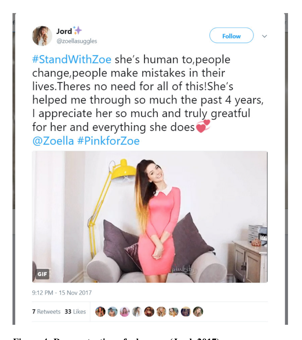
Figure 4: Demonstration of advocacy (Jord, 2017).