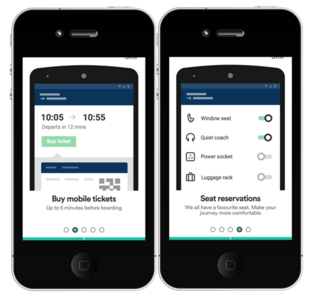
Figure 2. Trainline App Loading Screen (Trainline 2017).

ability to book last-minute mobile tickets or to add extra-service benefits (Trainline 2017b). These introductory tactics are immediately presenting Trainline as competent by emphasizing its fixation with providing service excellence (Michell et al. 1998; Caldwell and Clapham 2003).