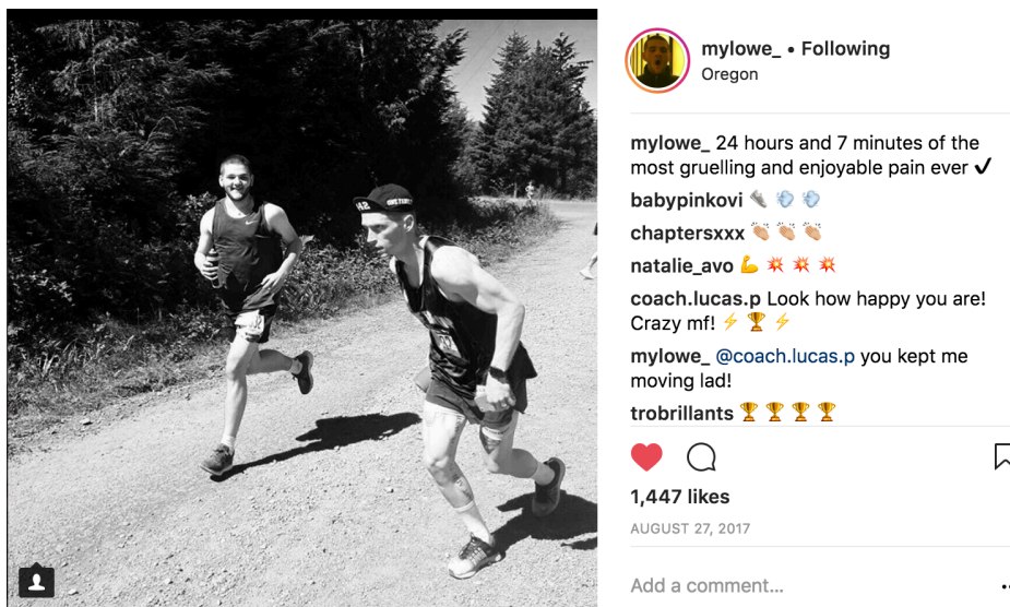
Figure 3. Post-Nike event positive word-of-mouth spread on co-creator’s social media (Black 2017).

If customers have been through an exclusive experience, they are more likely to engage in positive word-of-mouth communication (Lacey et al. 2007). Drawing from the relationship marketing co-creation investment examples previously stated, BSMNT publicise these experiences on their social platforms and spread positive word-of-mouth about their experiences (Figure 3).