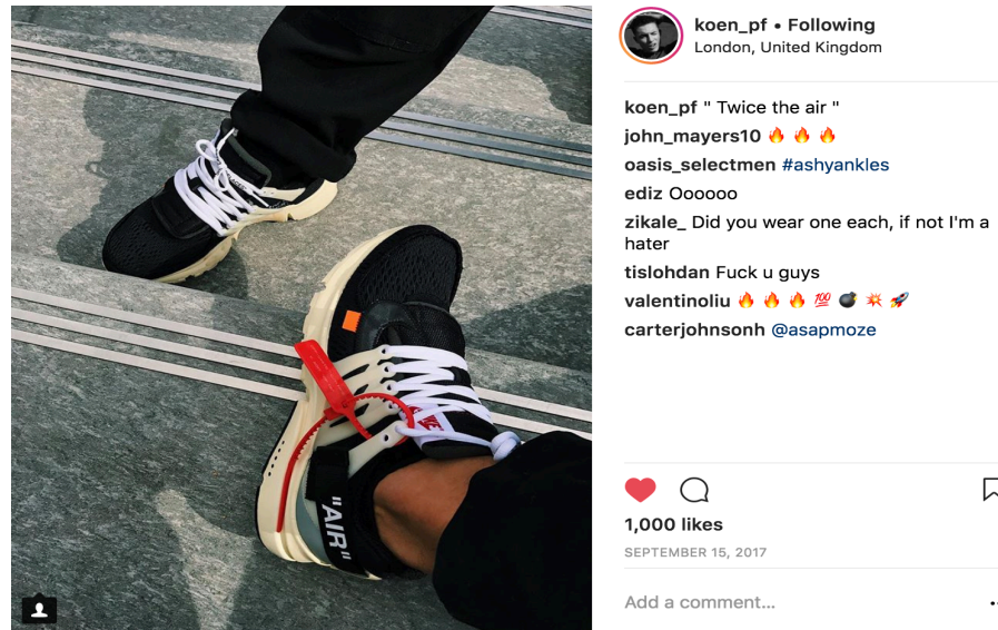
Figure 2. Nike Financial Co-Creation Investments appearing on co-creators' channels (Prince-Fraser 2017)

of a relationship, Nike often provides its collaborators with free product (Figure 2). This also indirectly aids Nike's promotion strategies and acts as a form of unpaid endorsement, as the collaborators share their new products to their follower base via social media.