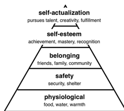
Figure 1: Maslow’s Hierarchy of Needs